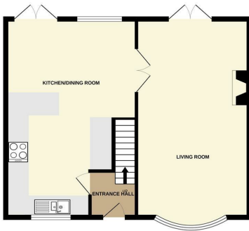
GROUND FLOOR 637 sq.ft. (59.2 sq.m.) approx.